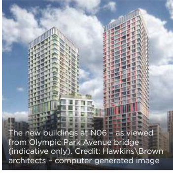
The new buildings at N06 – as viewed from Olympic Park Avenue bridge (indicative only). Credit: Hawkins\Brown architects – computer generated image