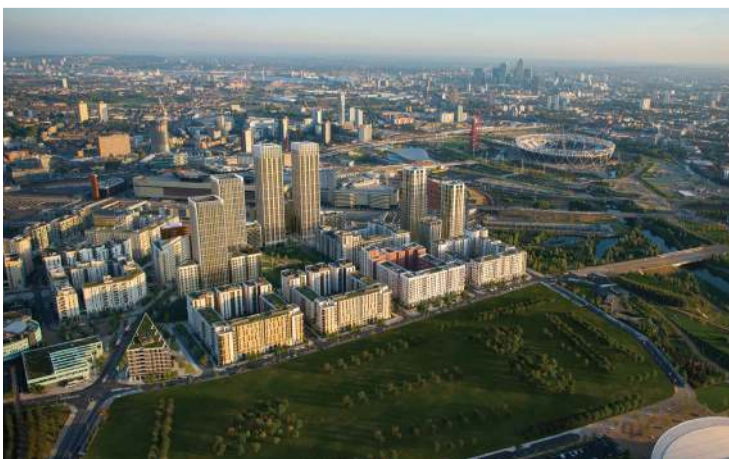
East Village with the new 2,000 homes in place, viewed from the North Credit: Lifschutz Davidson Sandilands architects - Computer generated image

East Village's history started before the London 2012 Games as part of the 2005 Stratford City Masterplan. This masterplan identified what is now E20 as an area of great regeneration opportunity.