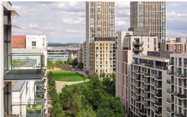
Victory Plaza brought 482 new homes to East Village in summer 2019

East Village is a growing neighbourhood and a key part of the regeneration that is taking place in this part of East London. The first residents moved into East Village towards the end of 2013 and more than 6,000 people now call the former London 2012 Athletes' Village home. Over the coming years East Village is set to grow further.